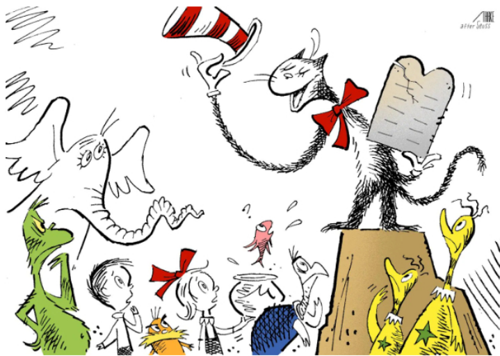
( (with apologies, of course, to Dr. Seuss))

Tell a Bible story or other old tale as another writer would. Plus 'Questionable Journalism.'